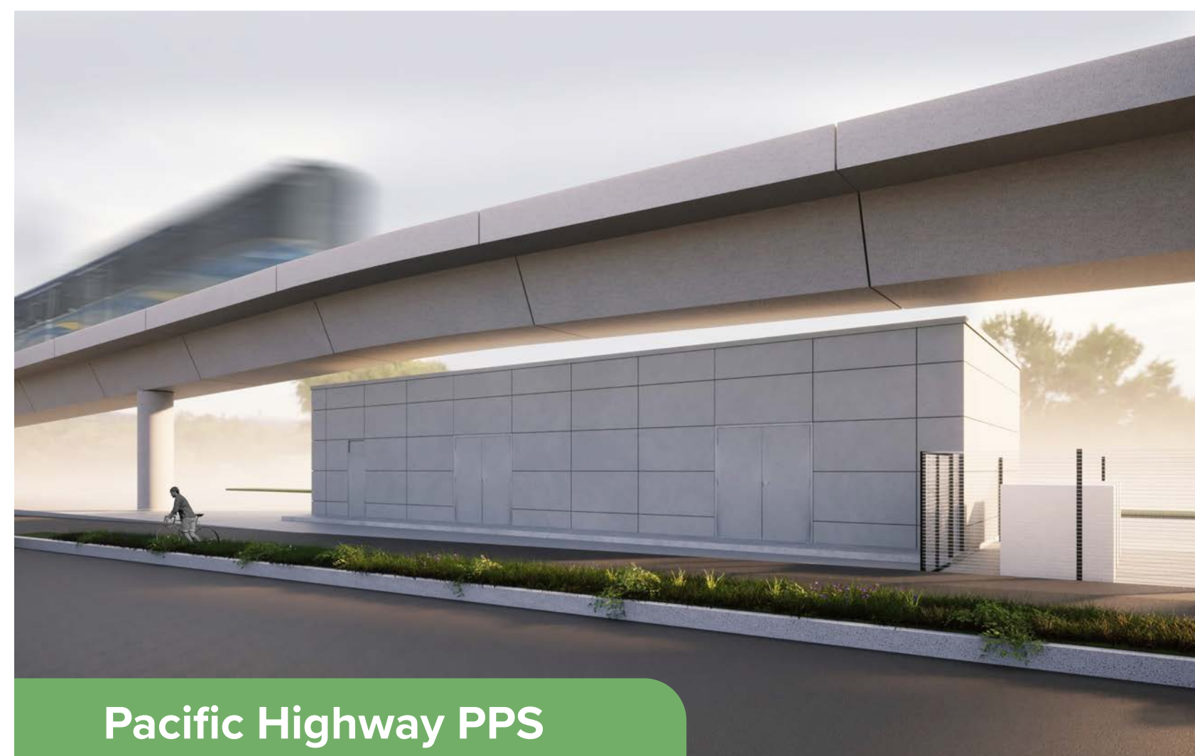
Conceptual rendering, subject to change