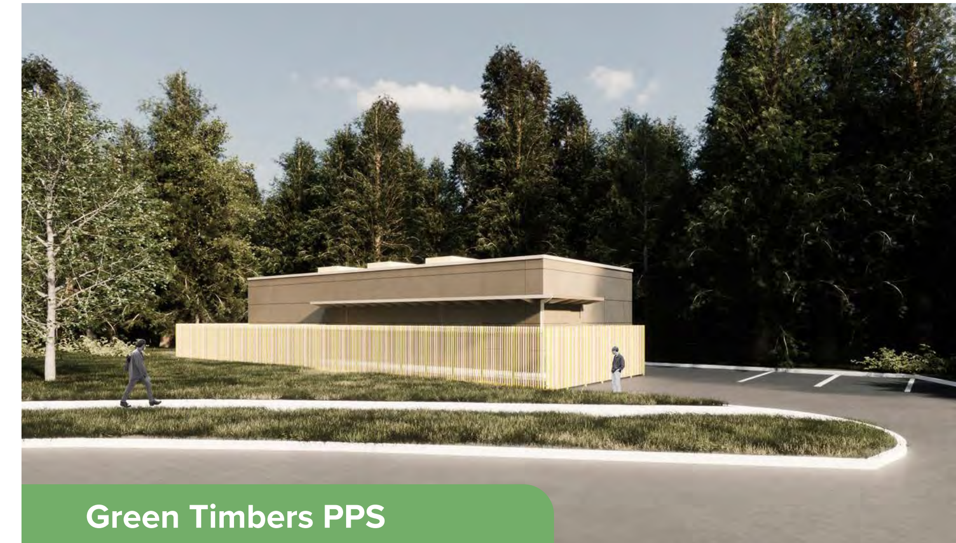
Conceptual rendering, subject to change