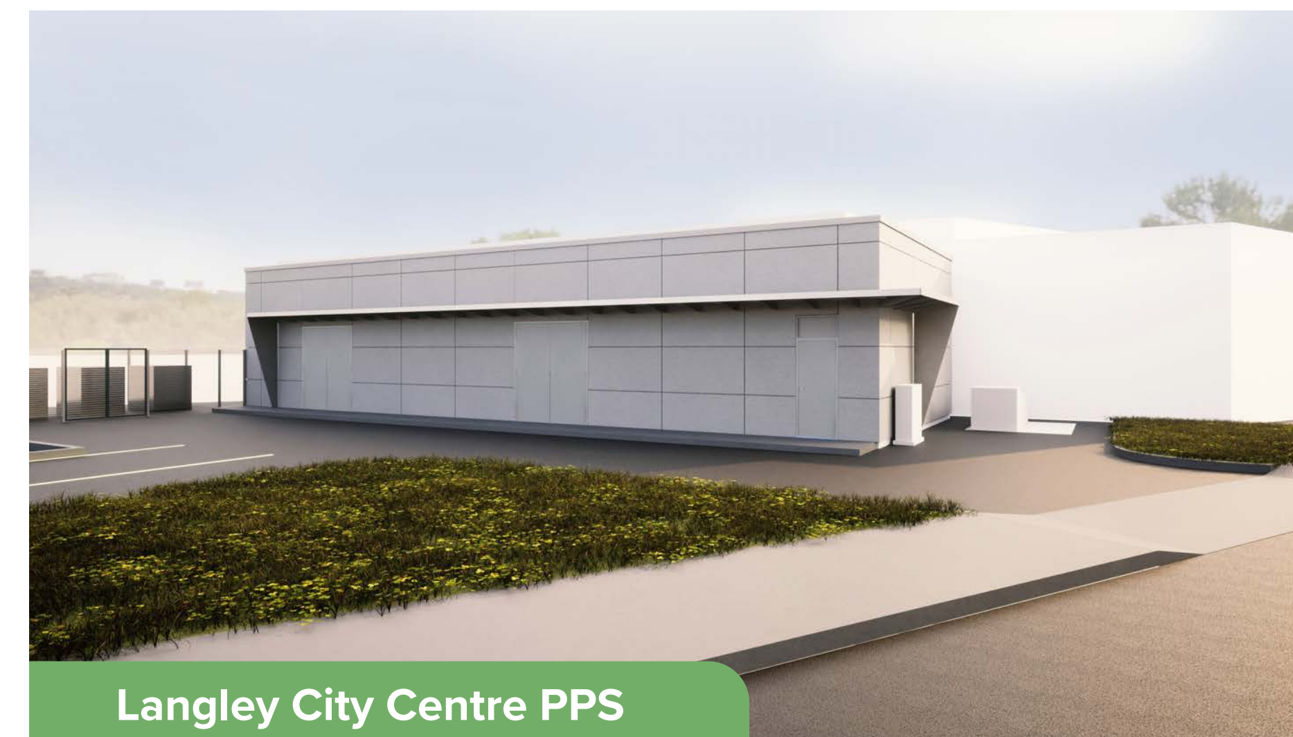
Conceptual rendering, subject to change