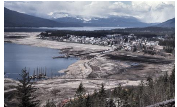
Nakusp waterfront during spring on Arrow Lakes Reservoir