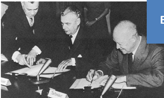
Diefenbaker and Eisenhower signing the Treaty in 1961