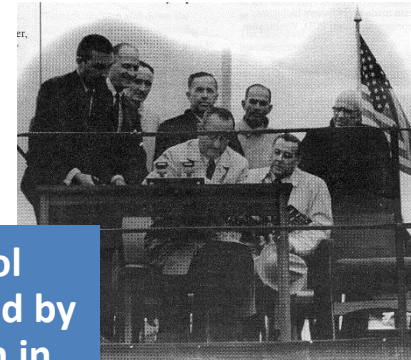
Treaty and Protocol ratified and proclaimed by Pearson and Johnson in 1964