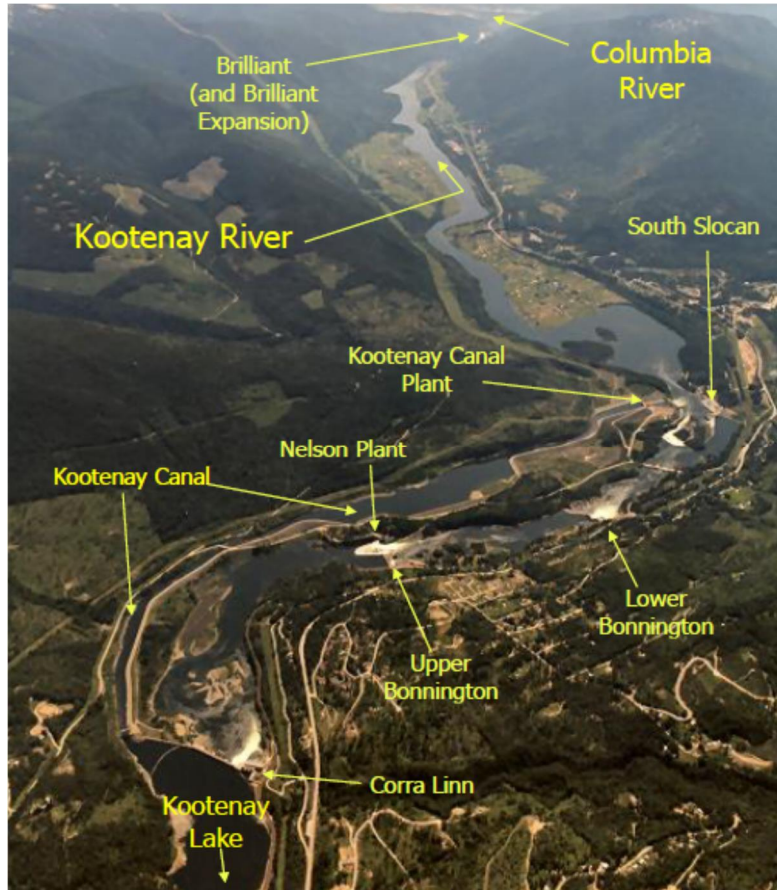
Figure 2. Lower Kootenay River Dams (from International Kootenay Lake Board of Control – International Joint Commission – IJC).

This focus is on ecosystems and habitats, rather than a single-species approach. The dam and reservoir operations have impacted numerous species and guilds, including many listed species (Utzig and Schmidt 2011), and therefore this approach is likely to be more cost effective and provide a wider array of benefits than multiple single-species approaches.