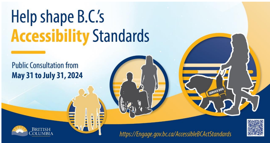
(Landscape graphic for Facebook)