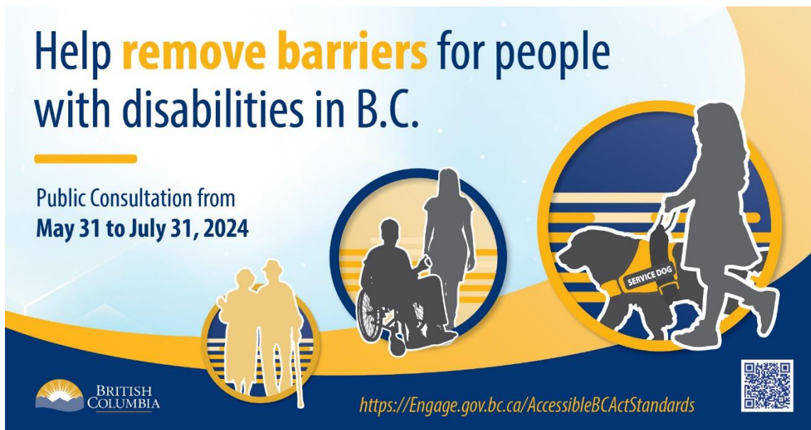
(Graphic for Instagram Reel or Story)